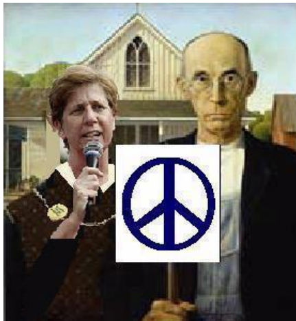
Brought to you by: Student Advocates for Global Equality, IUPUI